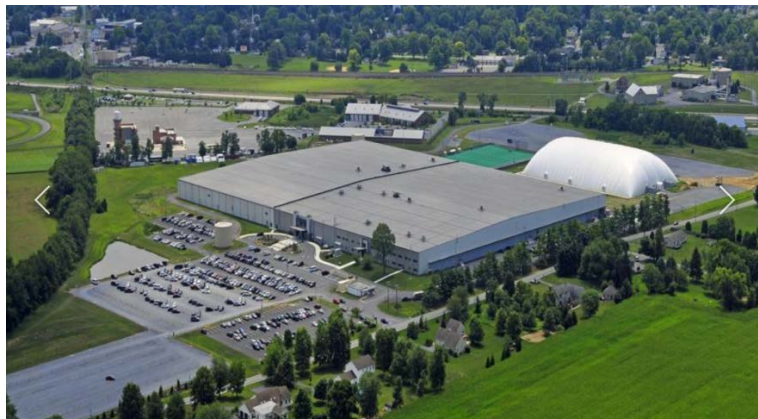
Spooky Nook overview

Spooky Nook Sports now is a destination for athletes, families and businesses. They have more than 700,000 square feet indoors, and over 50 acres outside of athletic facilities of every type for every season. Sports featured at “The Nook” include baseball, basketball, climbing, field hockey, flag football, gymnastics, lacrosse, soccer, softball, track and field, and volleyball.