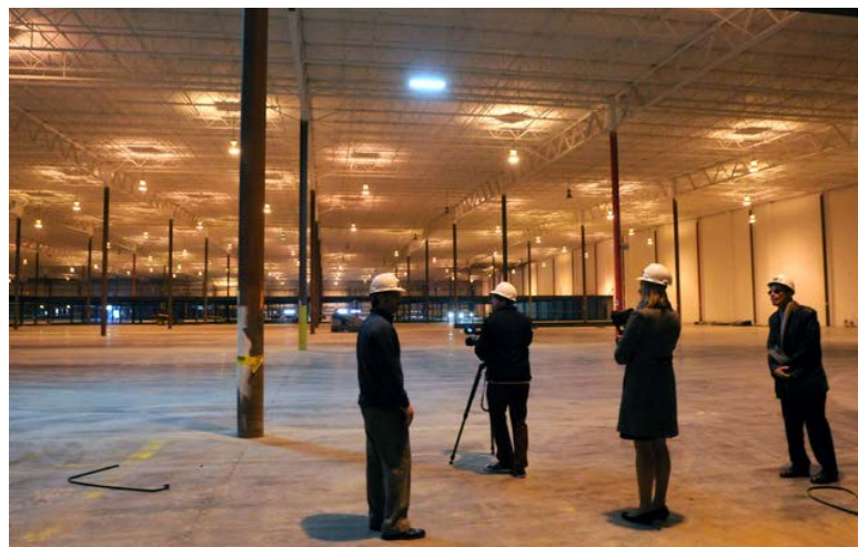
Converting factory to sports complex

According to Lancaster Online, the former factory once was bustling with over 1000 employees making floor and ceiling tiles. Demolition of many parts of the factory and associated buildings began in 2007. In 2011 the property was sold and was turned into the largest and most innovative sports complexes in the country.