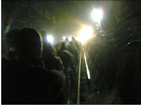
(Cell phone picture of people evacuating the train tunnels. Photo: Alexander Chadwick)

Economically, the event caused the British Pound to drop in value on the stock exchange. Although the world economy remained pretty stable, the Financial Times Stock Exchange index dropped substantially and the London Stock Exchange began taking emergency measures to prevent panic selling on the European markets. As a measure of preparedness after the event, the Bank of England implemented new contingency plans in case something like this happened again in the future.